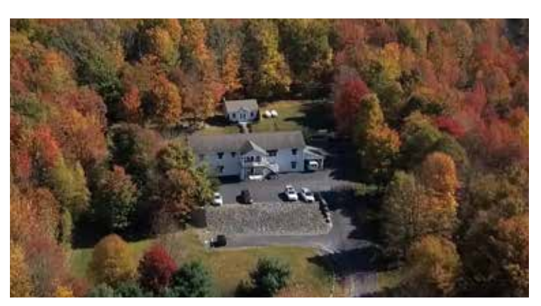
272 Hamlin Hwy · Moscow, PA 18444